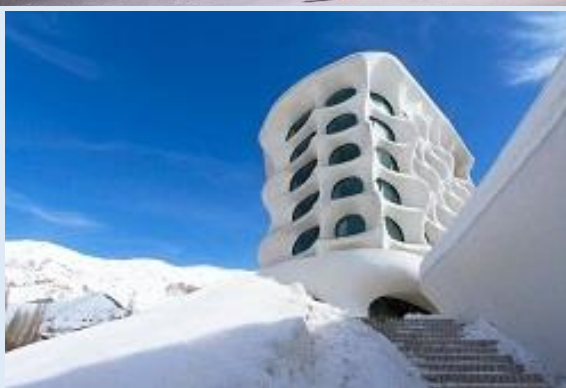
Hotel (Shemshak / Darbandsar)