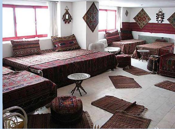
Gajereh Hotel (Gajereh Village near Dizin Ski Resort)